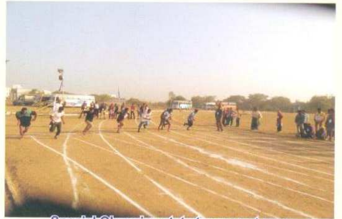
Special Olympics state tournament race