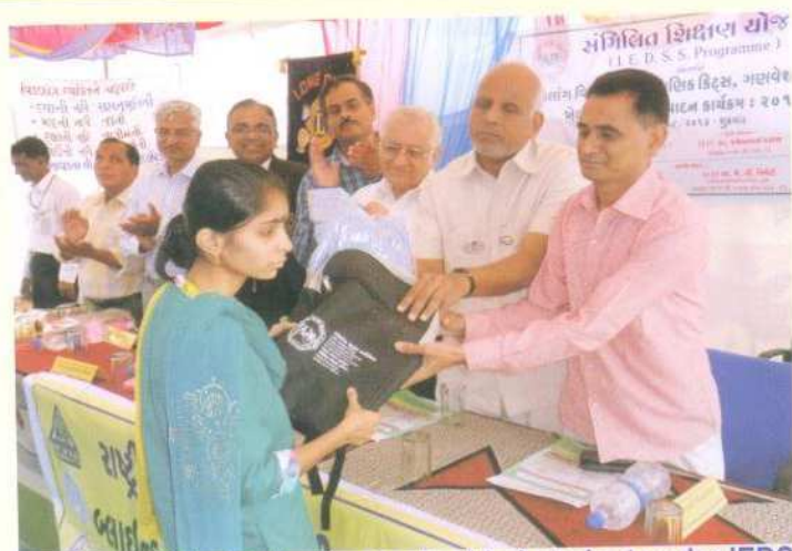
Educational kit distribution to disabled student under IEDSS