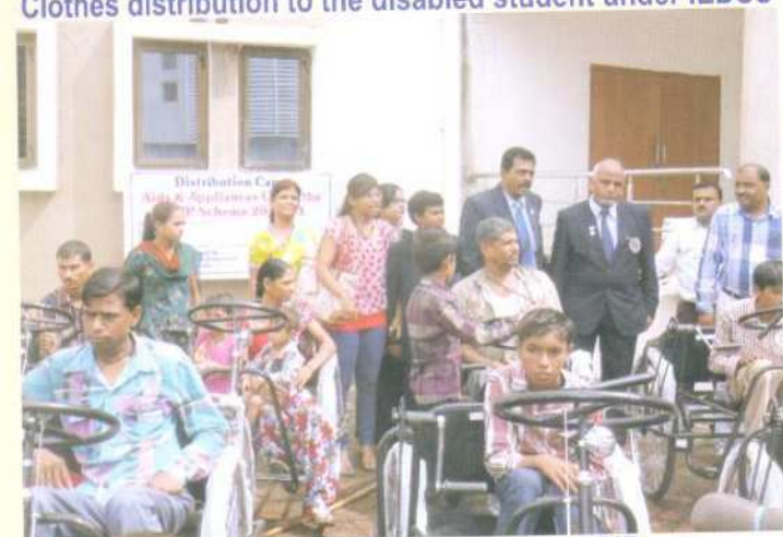
Distribution of tricycles under ADIP