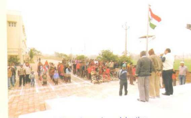
Independence day celebration