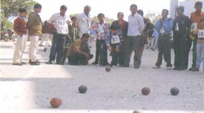
Boccee game SPO district tournament PMS.