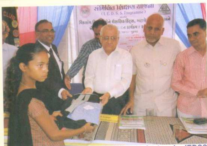
Clothes distribution to the disabled student under IEDSS