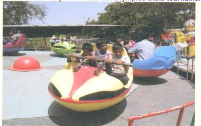
Students with mental retardation at 6 pocket fun park