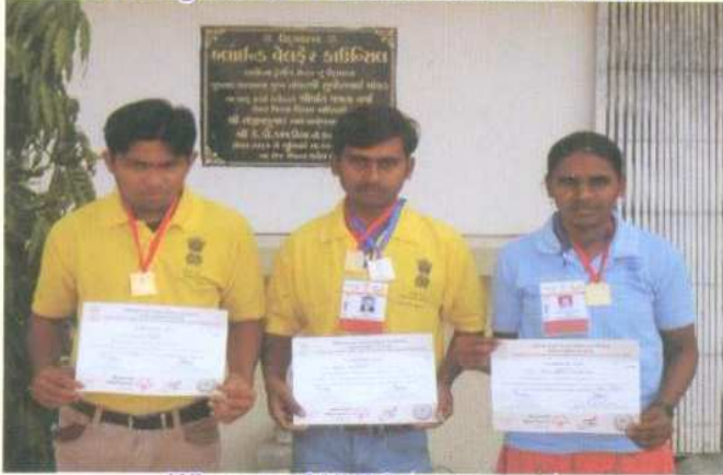
Winners of MYAS tournament