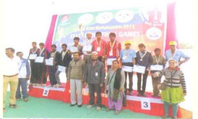
Winners of the Relay race at the SP. Olympics State tournament