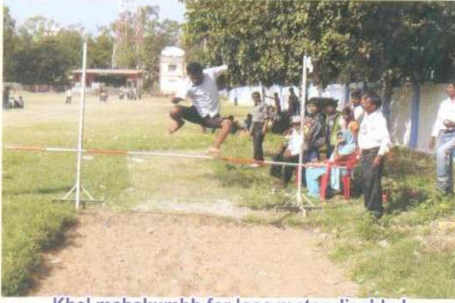
Khel mahakumbh for loco motor disabled